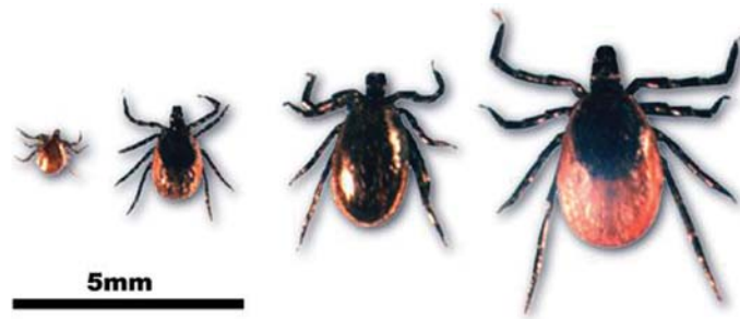
Larva, nymph, male and female ticks ( enlarged )

More information can be found on internet websites if you search for 'Lyme Disease'.