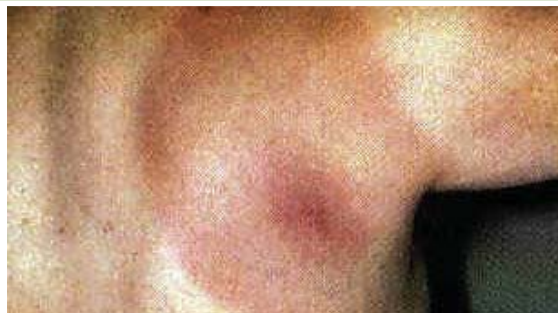
Swollen appearance of infected bite.

If left untreated, it will simply go on spreading across a much larger area but, if acted upon promptly, it will respond rapidly to effective antibiotic treatment. The more serious cases of infection may require longer and more strenuous antibiotic treatment which, once again, highlights the importance of prompt action.